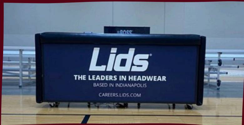
SCORE TABLE AD